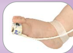
Infant Flex System (2 - 20 kg / 4 - 44 lbs)