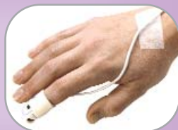
Adult Flex System (> 20 kg / > 44 lbs)