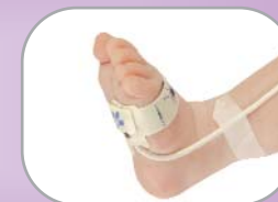
Neonate Flex System (< 2 kg / < 4 lbs)