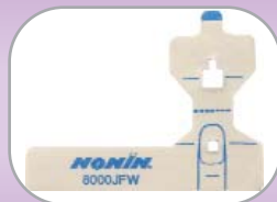
8000JFW Adult FlexiWrap