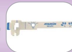
8001JFW Neonate FlexiWrap