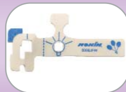
8008JFW Infant FlexiWrap